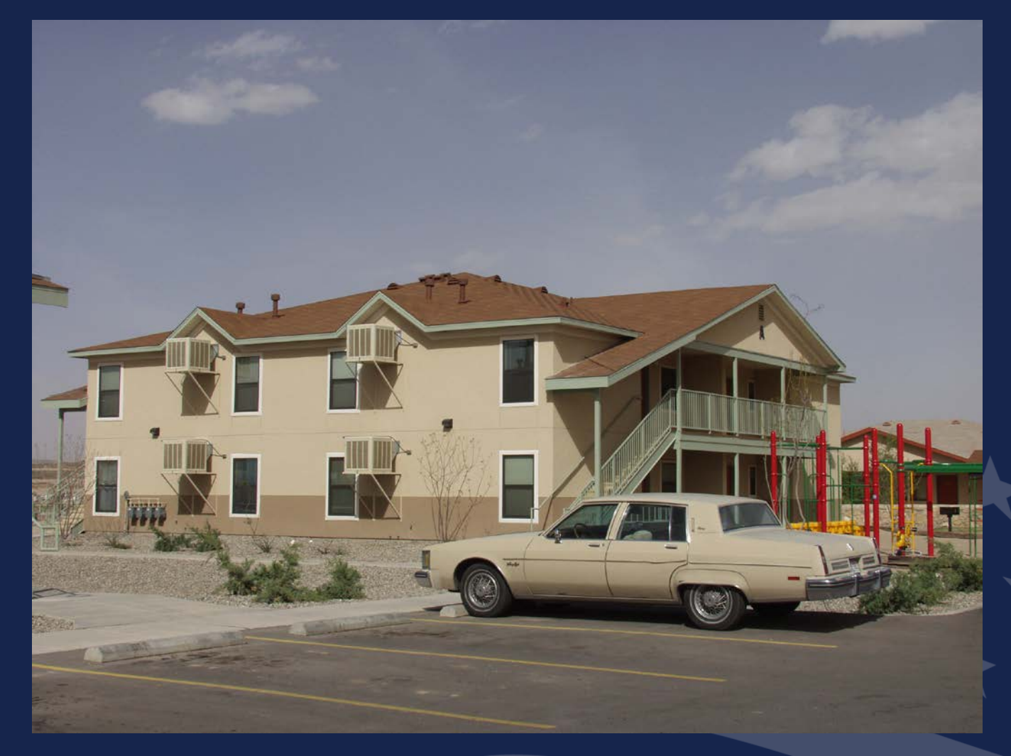
Franklin Vista Apartment Complex Anthony, NM