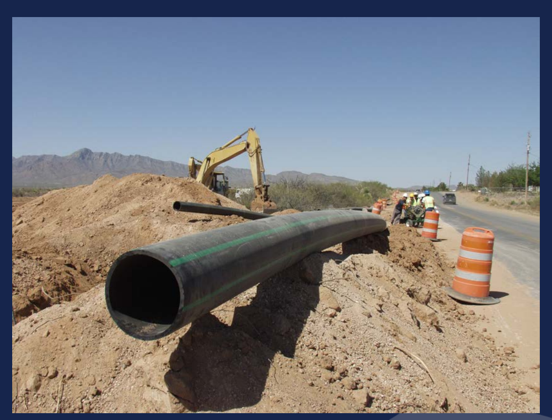
Wastewater System Construction Chaparral, NM