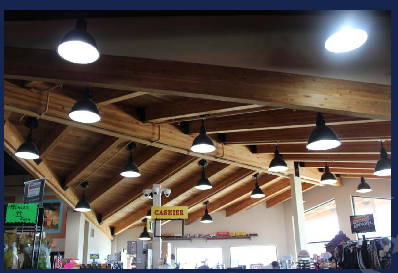
Russel's Truck Stop Energy Efficient Lighting San Jon, NM