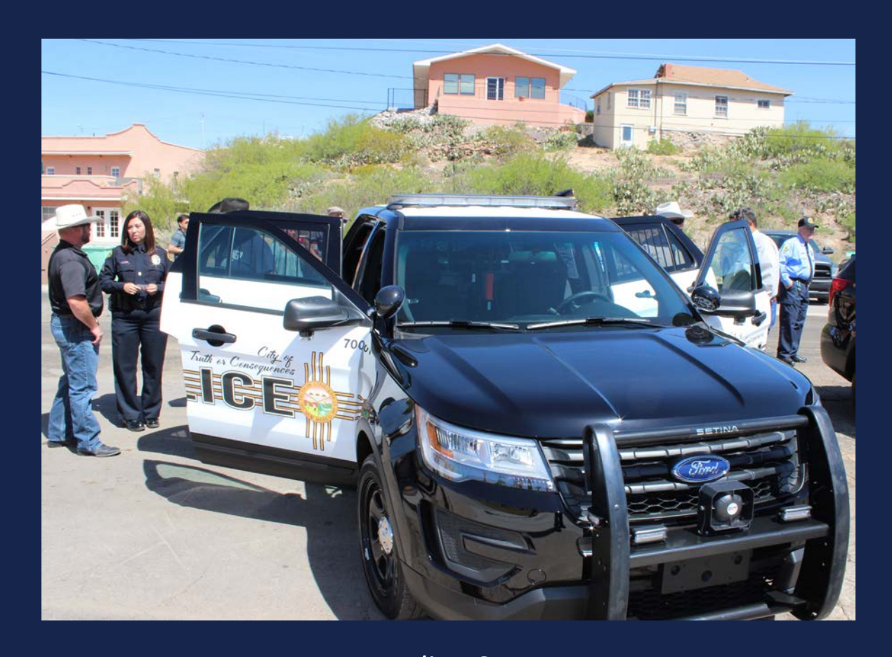
Police Cars Truth or Consequences, NM