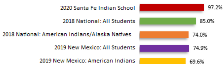
Four-Year Cohort Graduation Rate

SFIS provides a rigorous academic program in an environment that respects and values tribal communities' cultures and traditions. Our Ideal Graduates are academically high-performing students who are committed to maintaining Native American cultural values. According to both the National Governors Association and the U.S. Department of Education graduation rate formulas, SFIS maintains a four-year cohort graduation rate in the high nineties, putting SFIS well ahead of New Mexico's latest rate of 74.9 percent and the most recent national rate of 85.0 percent.