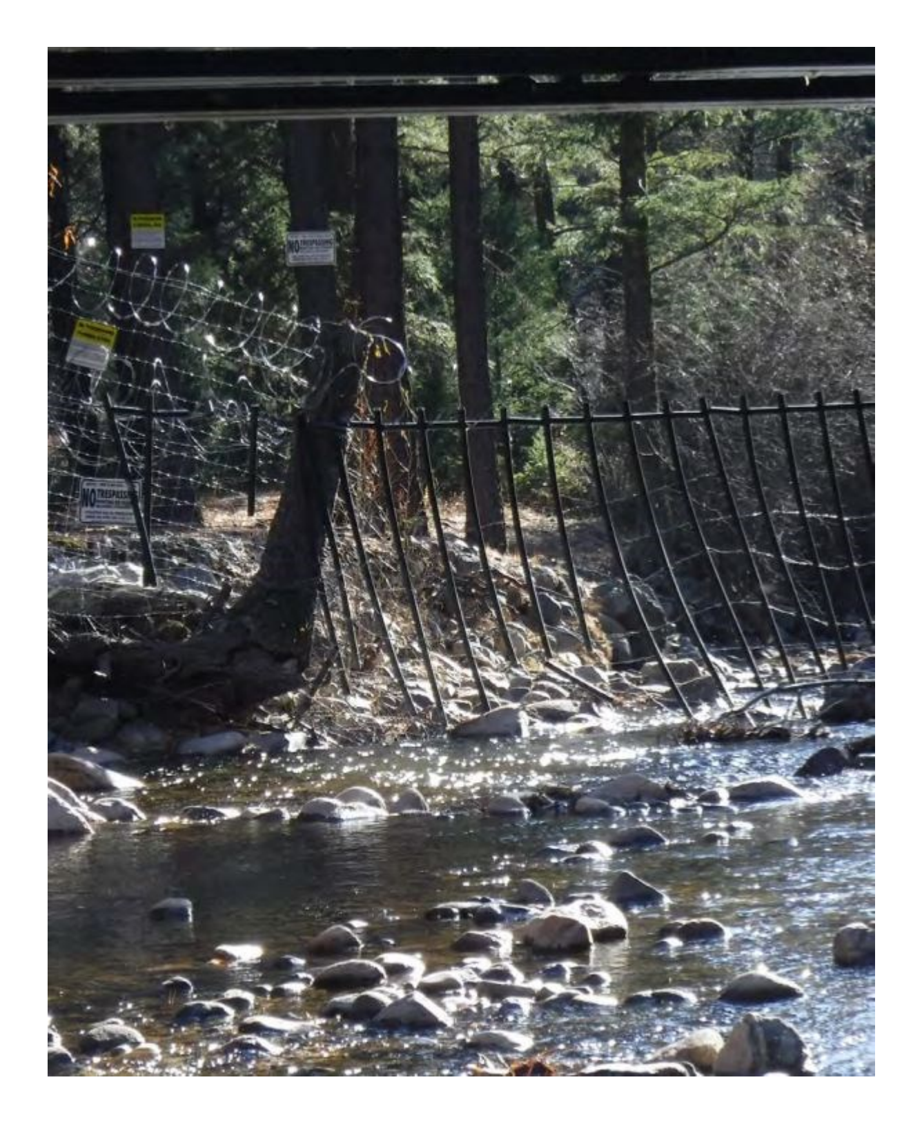
Exhibit F, Hersh Trust Barricade

Barricade is across the river and on both sides. Contains both concertina and barb wire. There are actually two barriers across the waterway.