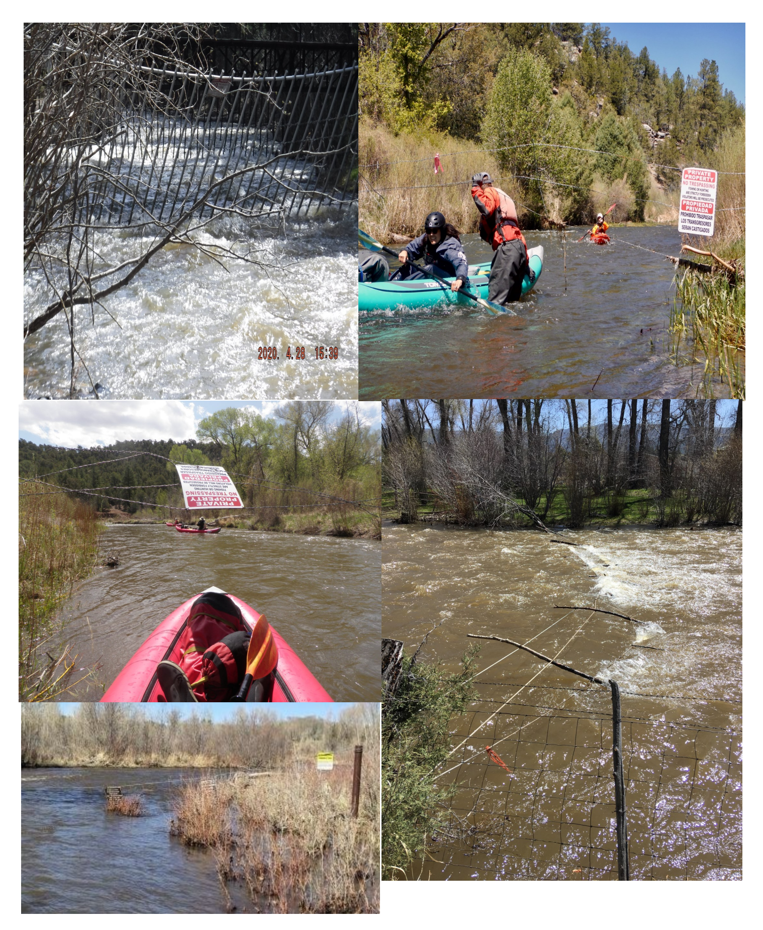
Exhibit A Barriers