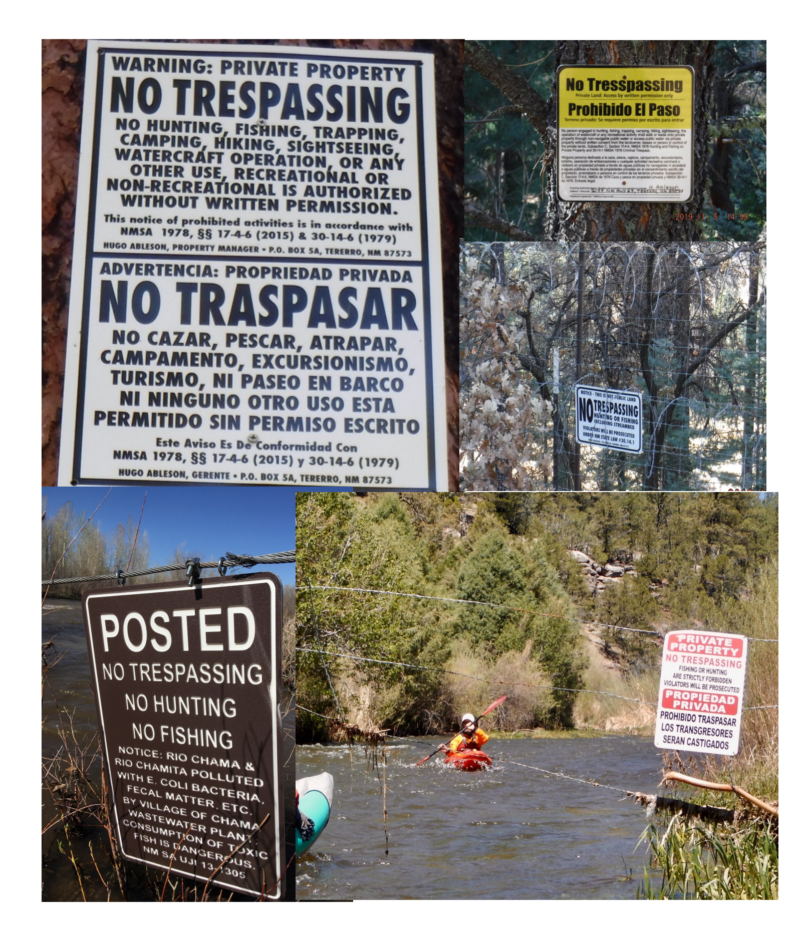
Exhibit C, Signage