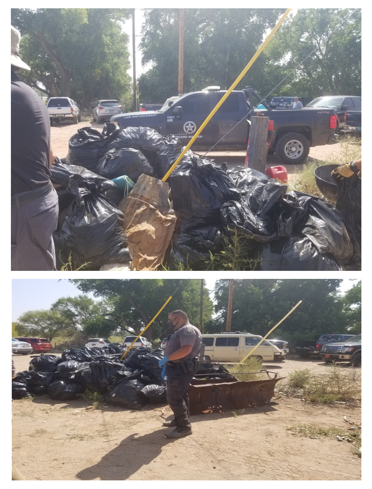
Exhibit H Stewardship with Partners

In 2021 we have organized or participated in at least 20 stewardship and safety events with our various partners