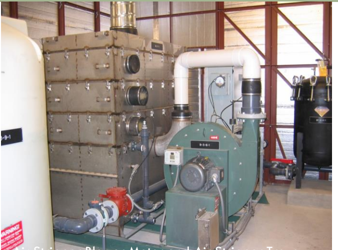
r Stripper Blower Motor and Air Stripper Trays