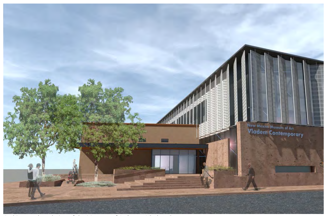
Architectural rendering of the Museum of Art's new Vladem Contemporary.

DCA is submitting three requests for Special Appropriations, one-time appropriations to complete specific projects already underway.