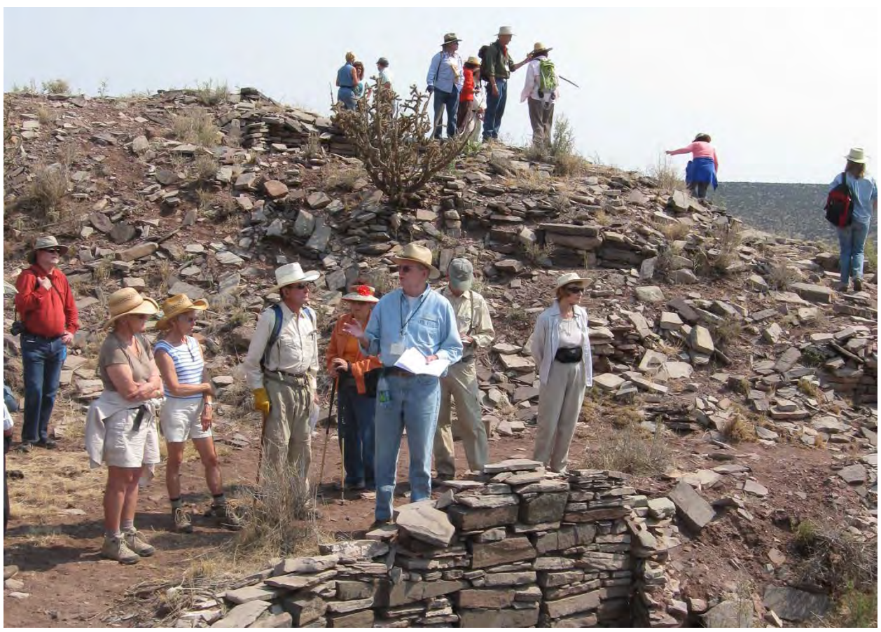
Volunteers from the Office of Archaeological Studies lead a tour of the Pueblo Largo the archaeological site.