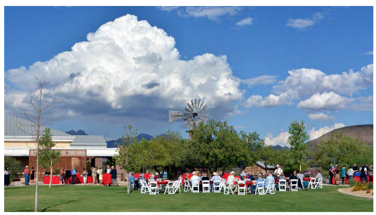
Heritage Garden at Farm Ranch Heritage Museum, after renovations