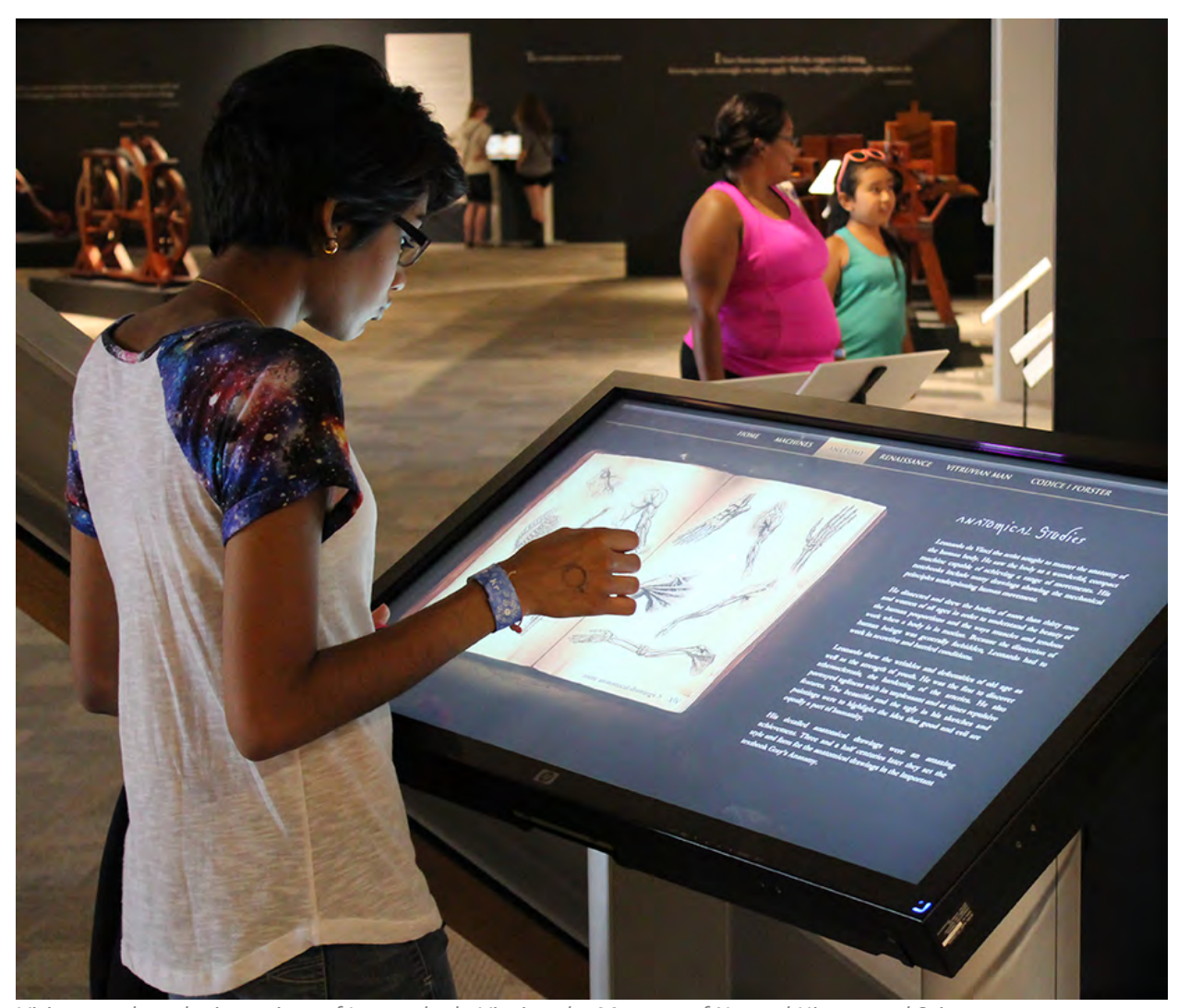
Visitors explore the inventions of Leonardo da Vinci at the Museum of Natural History and Science.