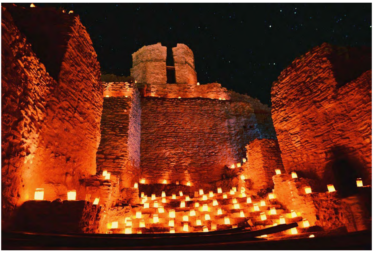
4,500 people attended Jemez Historic Site's annual December event, "Light Among the Ruins," in 2017, a steady increase over the 800 who attended in 2015.