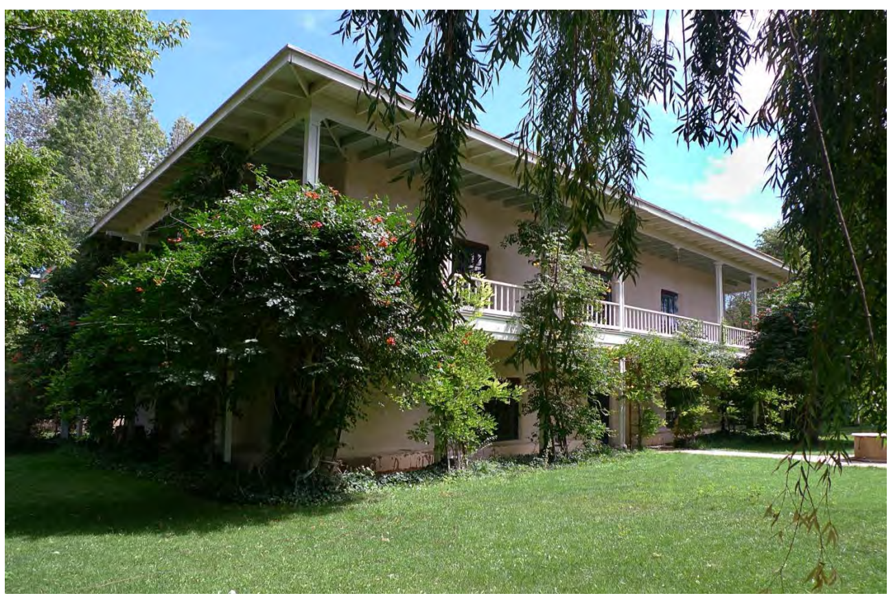
The Casa Grande at Los Luceros Historic Site in Alcalde.