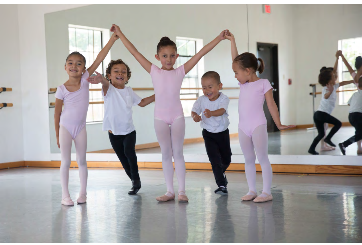
Students from the School of the Aspen Santa Fe Ballet, which receives funding from New Mexico Arts.