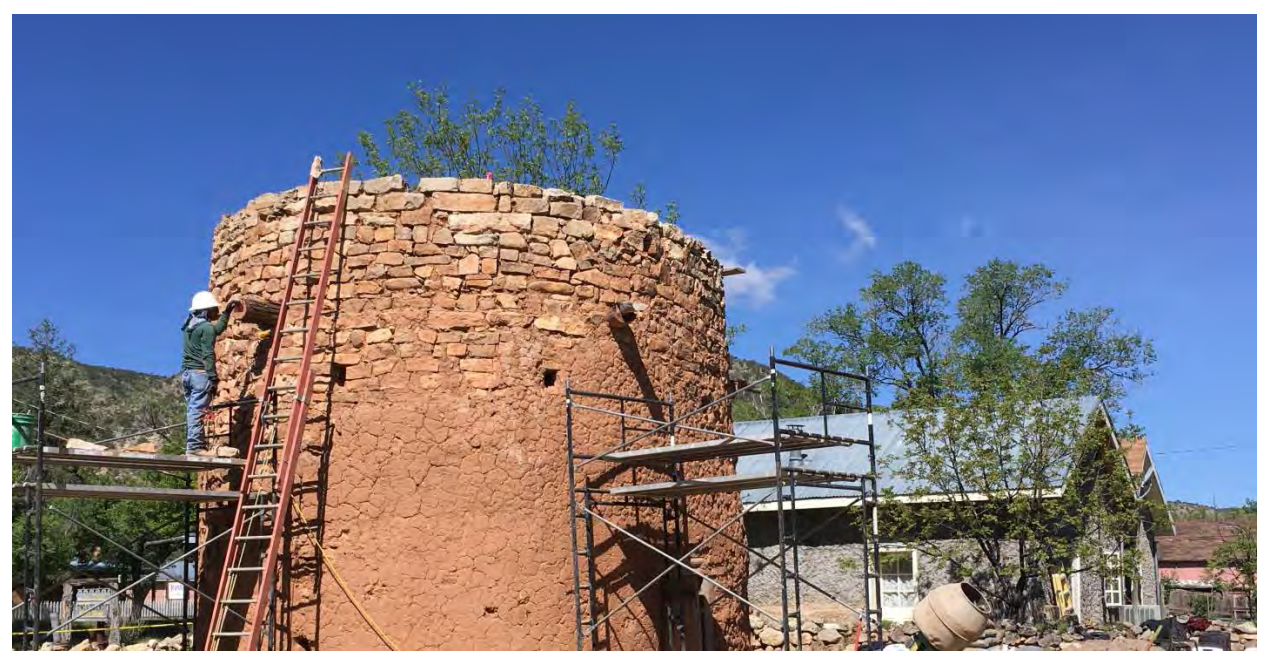
Torreon at Lincoln Historic Site under construction