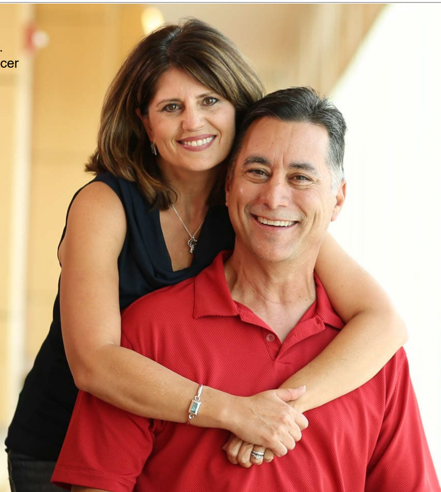
Lawrence G. Thyroid Cancer Survivor

To reduce the cancer burden and overcome the tremendous cancer health disparities in New Mexico and the nation through: