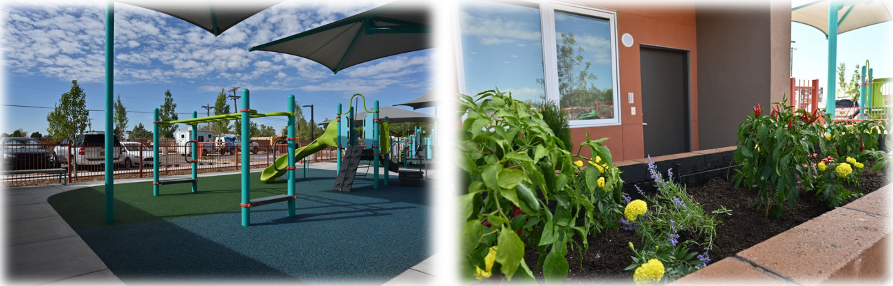
Calle Cuarta Apartments in Albuquerque, NM is a 61-unit development targeting households with children.