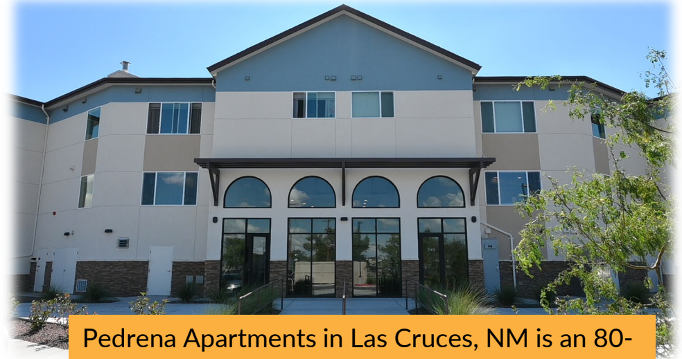
Pedrena Apartments in Las Cruces, NM is an 80-unit multifamily development for seniors age 55 and over.