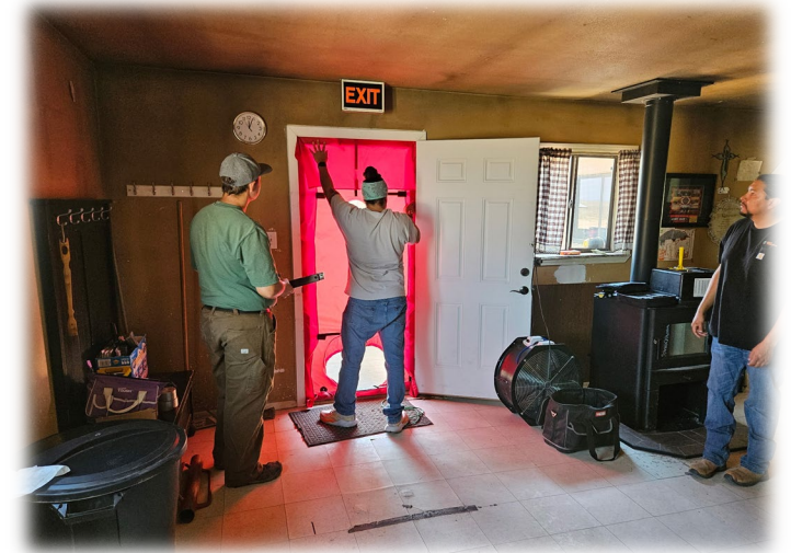
Weatherization team and service providers performing a monitoring