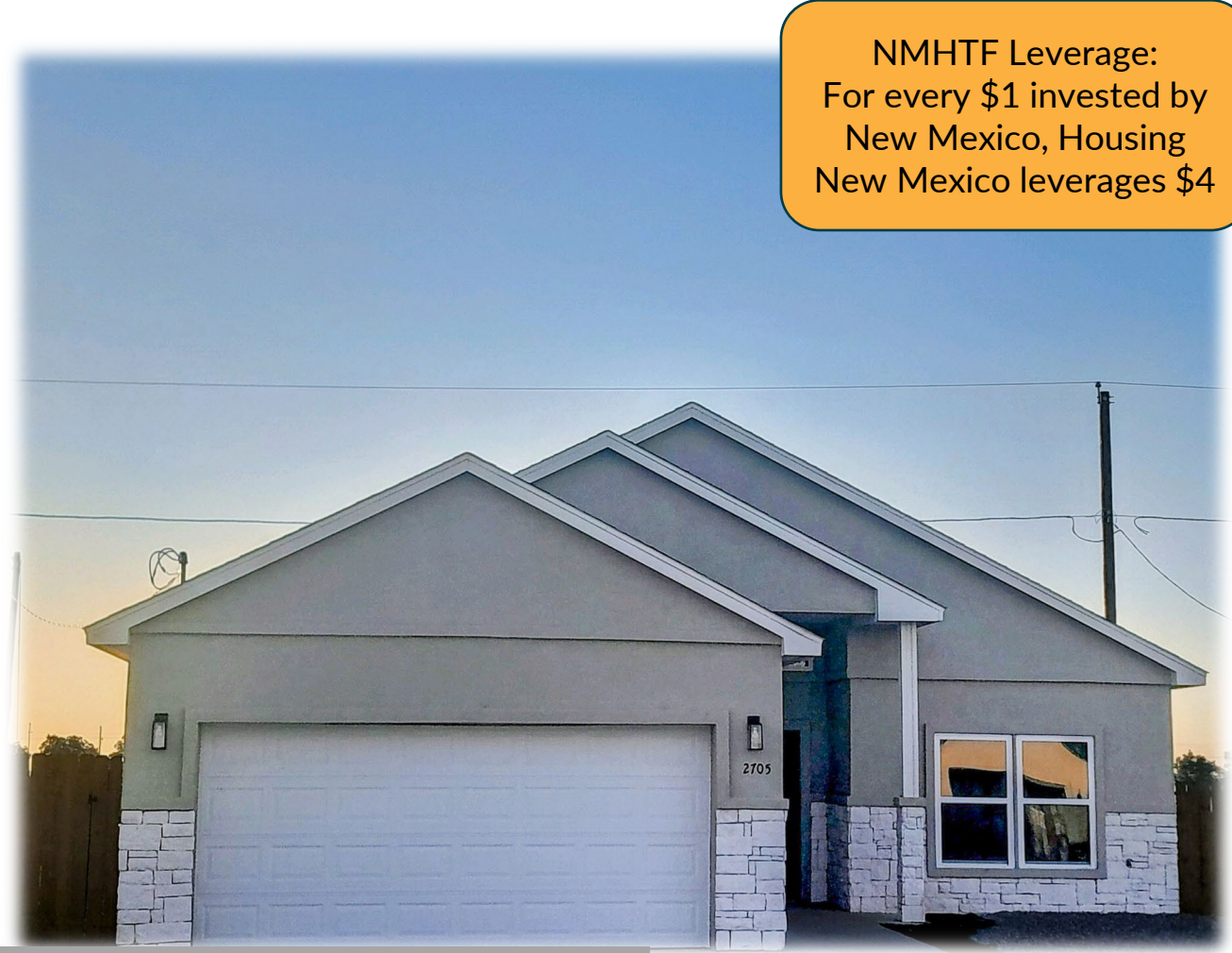
El Toro single-family residential community in Roswell