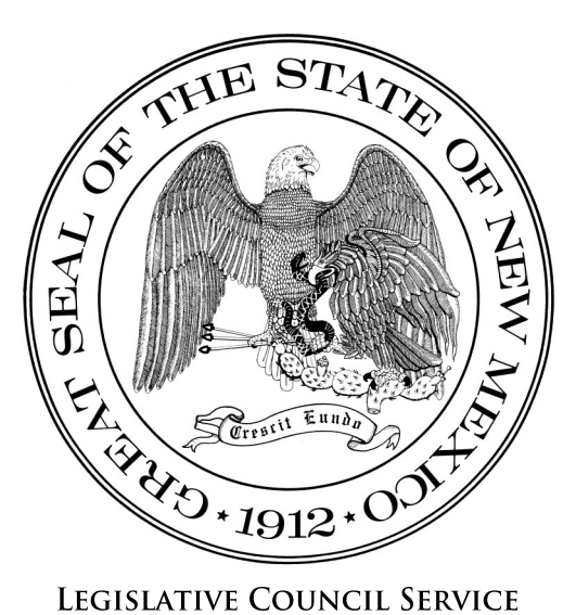
Legislative Council Service Santa Fe, New Mexico