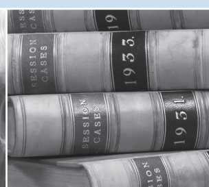
Law. Health. Justice.