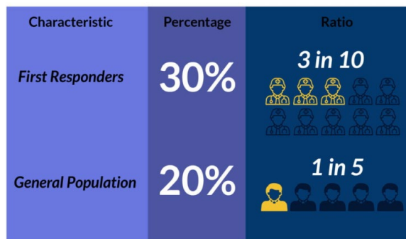
Prevalence of PTSD Between the General Population and First Responders

Per the Center for the Advancement of Health, 30% of first responders have mental health issues compared to 20% of the general population, and 80% of first responders describe being exposed to trauma during the course of their job duties. Between 10% and 15% of first responders have a PTSD diagnosis and 400,000 annually report symptoms of PTSD. Knowledge that PTSD symptoms they experience may be job related may increase their likelihood to seek and receive treatment.