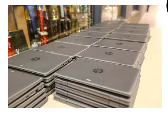
9000 student devices 800 teacher devices 2,460,000 OPS 1,400,000 CARES