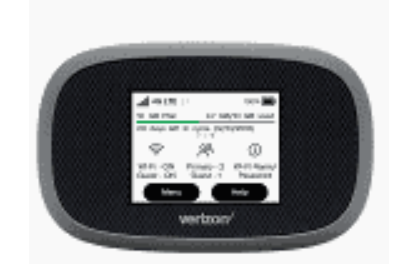
Over 300 Hotspots distributed to students $778,000 OPS