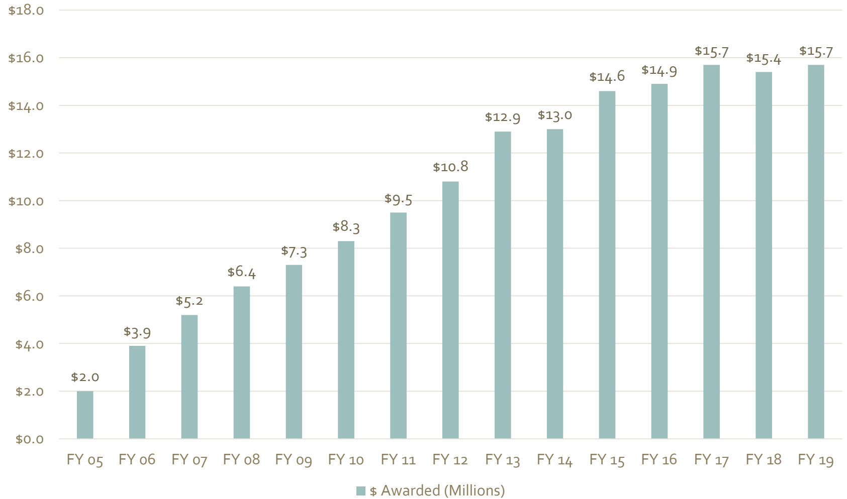
Lease Assistance Dollars Awarded