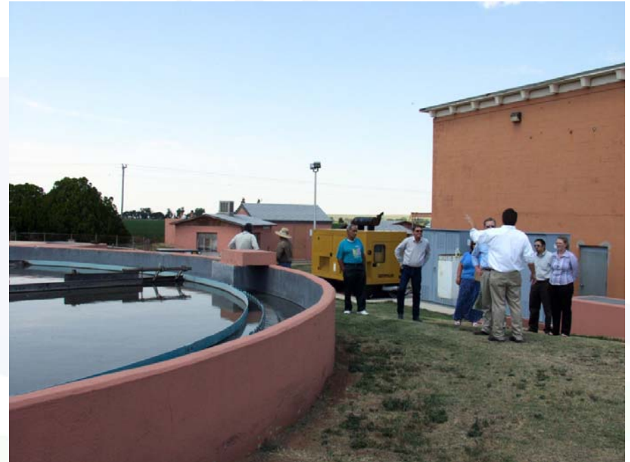
Tucumcari Wastewater plant. Rural Development assisted with the upgrade and modernization of the facility.

Assistance Type: Direct loan, loan guarantees or grant