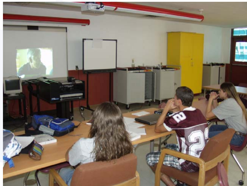
High school students in Roy engage in a history course from Clovis Community College using distance learning equipment.

Direct loans and grants to counties and incorporated entities operating schools, libraries or clinics