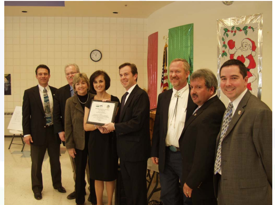
Obligation Ceremony, Guadalupe County Hospital

Assistance Type: Direct loan, loan guarantees or grant