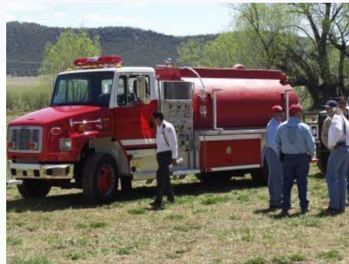
Ledoux Fire Station