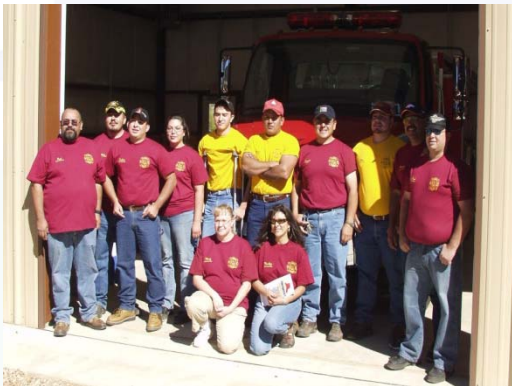
Ledoux Fire Station Opening