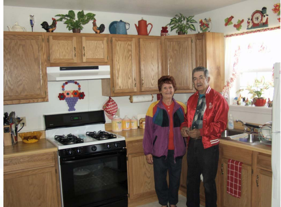
The Vigil family received USDA RD funding to refurbish their home in Clayton.