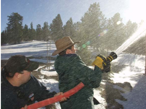
Angel Fire Fire Station