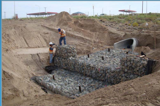
After; Location 1 Almost Done