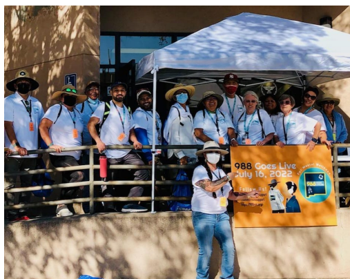
Therapists, Peer Support Specialists, City Government, 988 staff provided support during Ceremonial