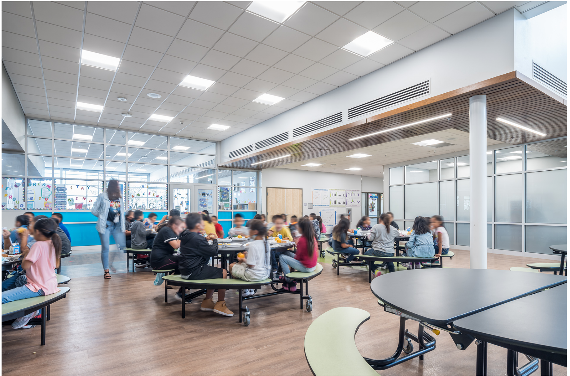
Gallup-McKinley – Thoreau ES – Dekker Perich Sabatini