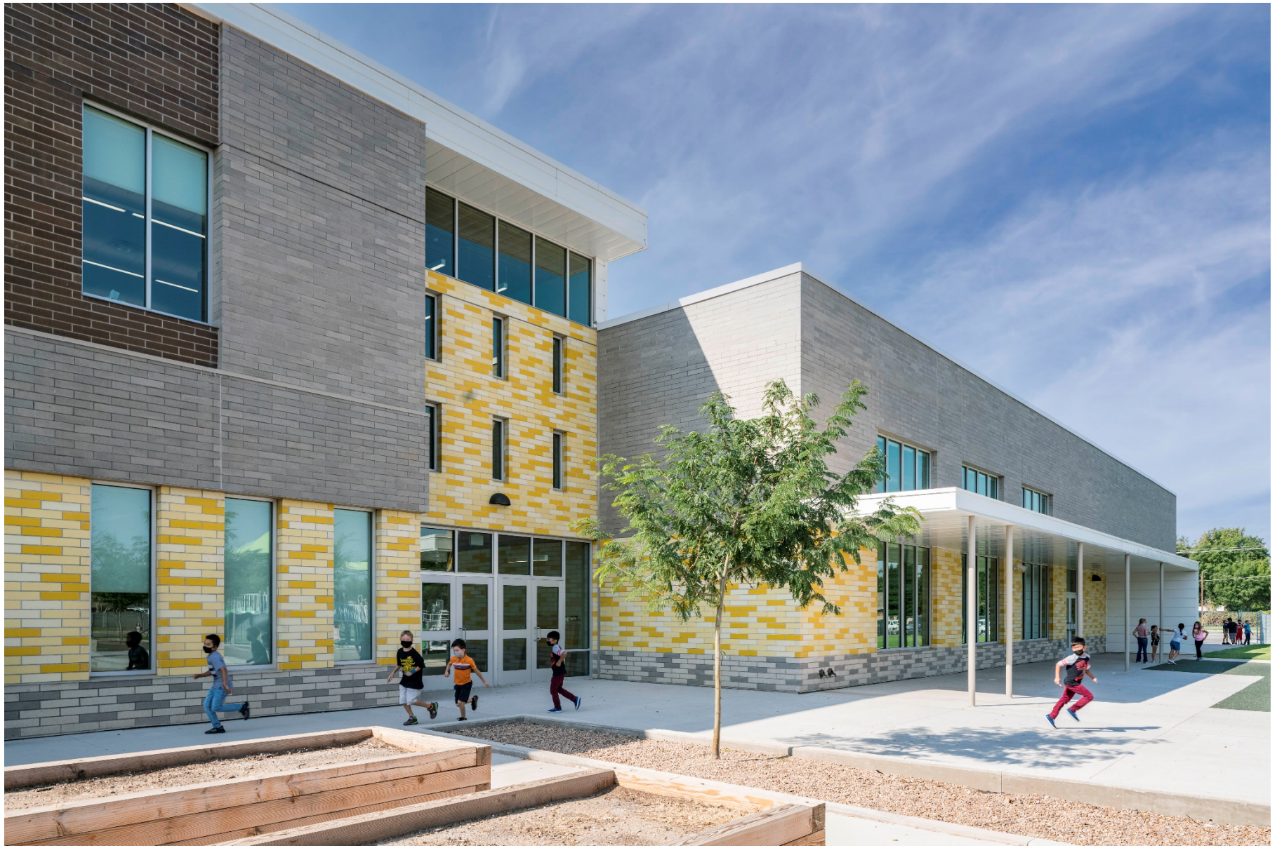
Roswell – Del Norte ES – SMPC Architects