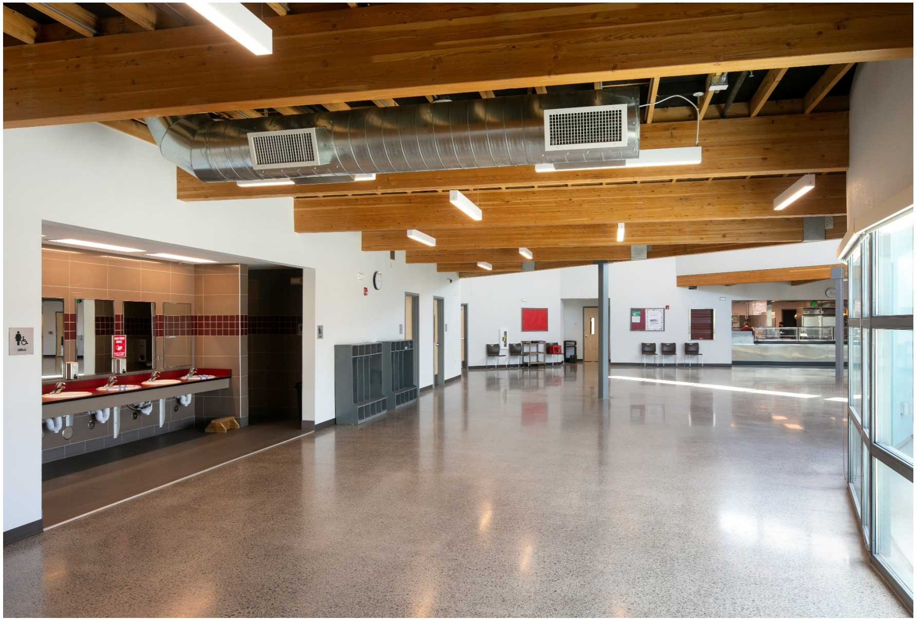
Belen - Rio Grande ES – NCA Architects Professional Photo courtesy of Patrick Coulie