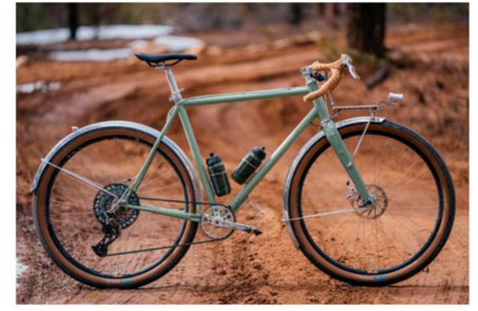
A bicycle manufactured by Baphomet Bicycles, a new manufacturing company based in Valdez.