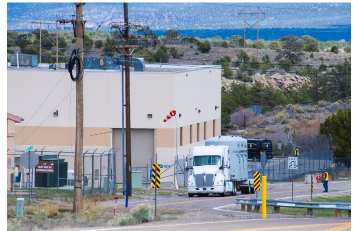
RANT Shipping Facility