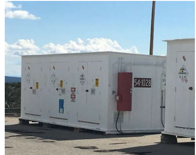
Tritium Storage Shed at Area G