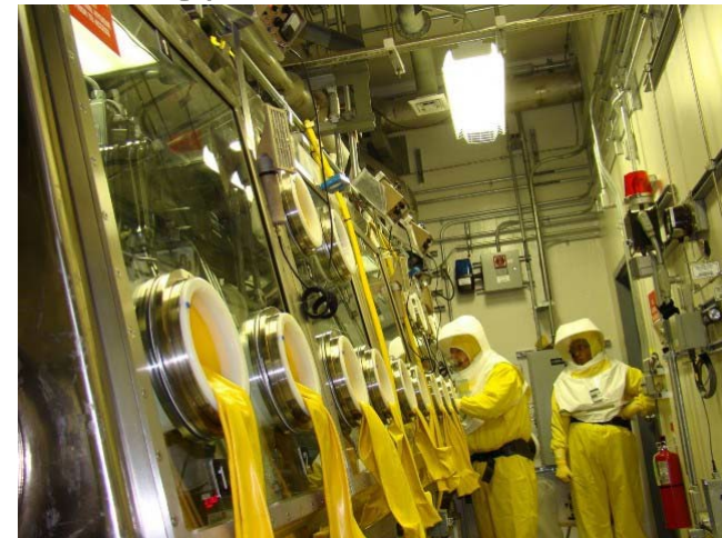
Glovebox Operations at Savannah River Site

DOE is required by law to grant the Board “ready access to such facilities, personnel, and information as the Board considers necessary to carry out its responsibilities.”