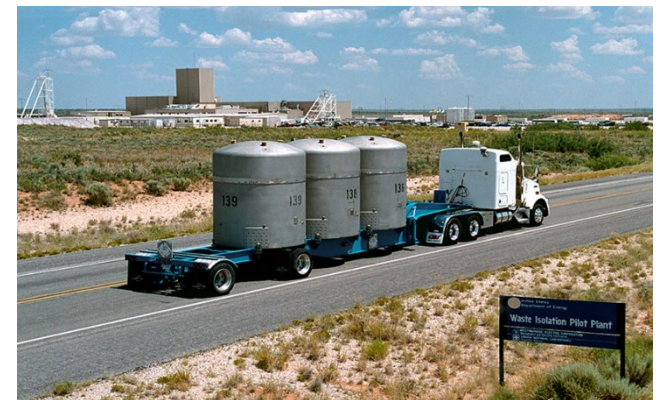
Waste Isolation Pilot Plant

DOE’s Defense Nuclear Facilities in New Mexico