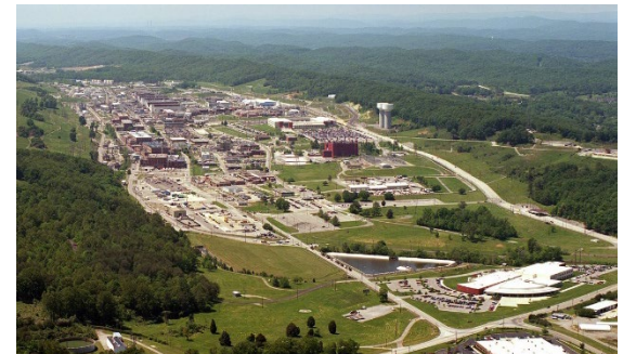
Y-12 National Security Complex

Resident Inspectors perform near-continuous oversight at Hanford, Los Alamos, Pantex, Savannah River Site, and Y-12