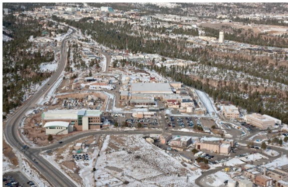
Los Alamos National Laboratory