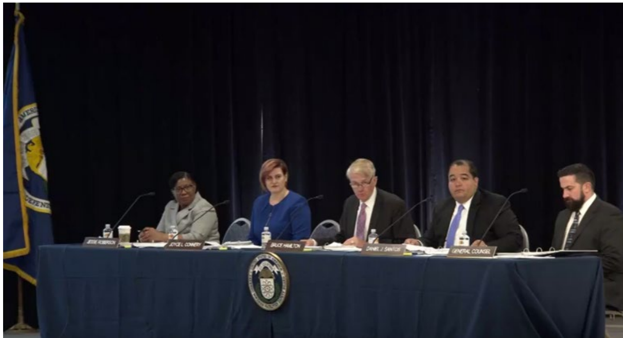
Public Hearing in Albuquerque, NM