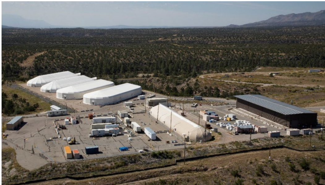
Transuranic Waste Operations at Area G