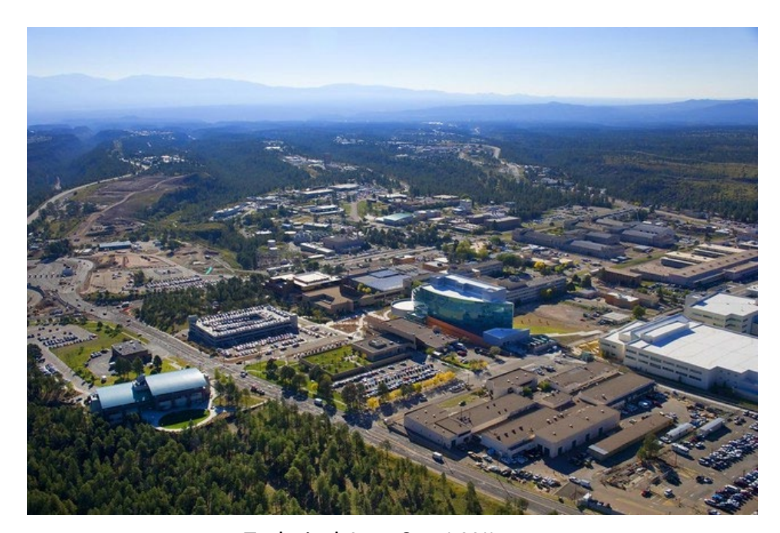
Technical Area 3 at LANL