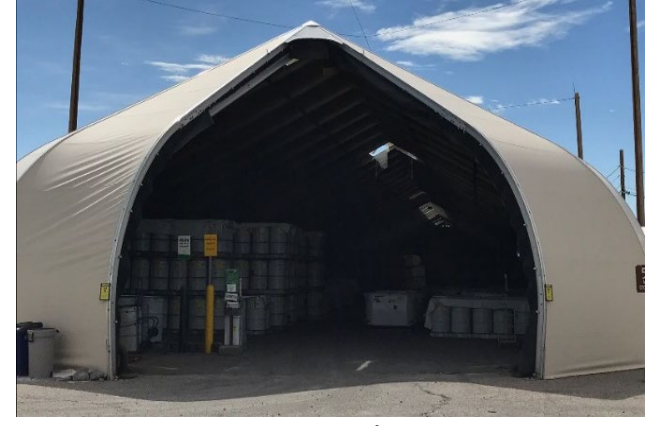
Dome 49 at LANL's Area G

Resident Inspectors perform onsite oversight at Hanford, Los Alamos, Pantex, Savannah River Site, and Y-12.