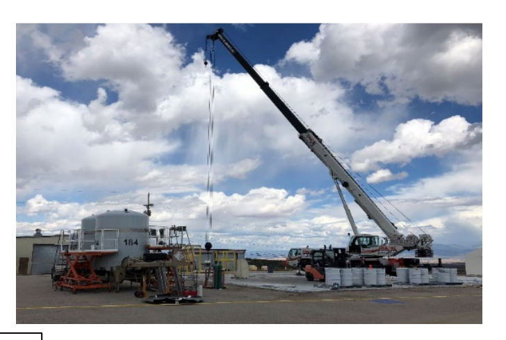
Mobile Loading Transuranic Waste at LANL's Area G