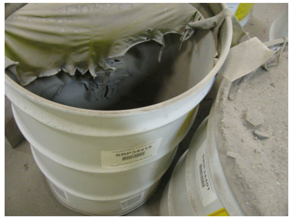
Waste Drum After Event at INL