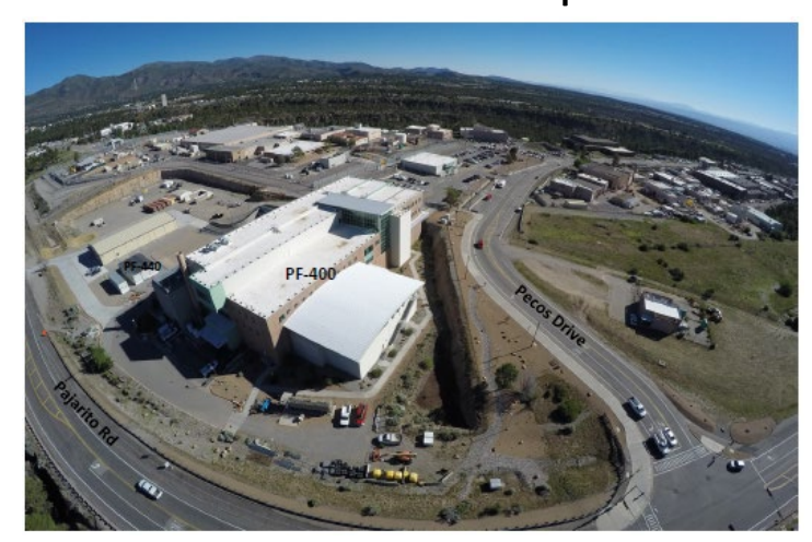
Aerial View of RLUOB/PF-400

record and LANL-identified fire protection deficiencies.