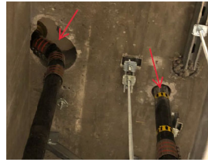
Fire Barrier Deficiencies in RLUOB