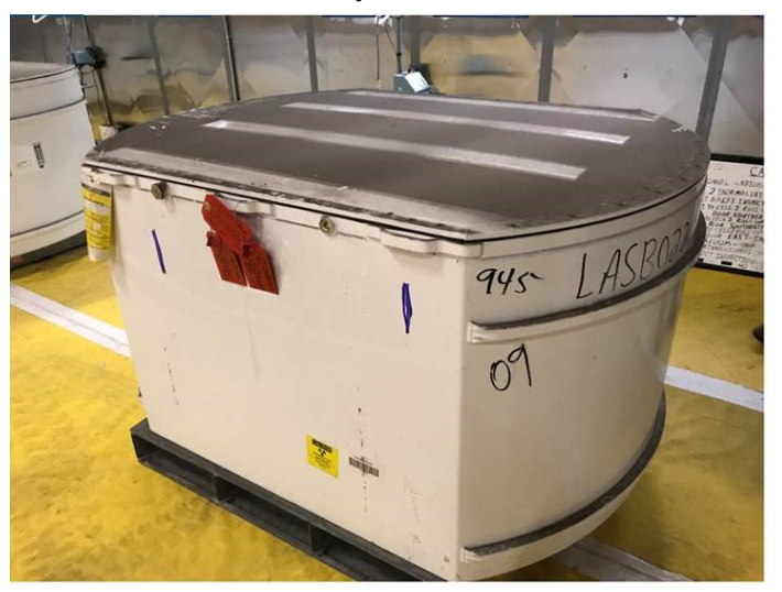
N3B Implemented Additional Safety Controls for Containers at LANL's Area G as a Result of Technical Report 46