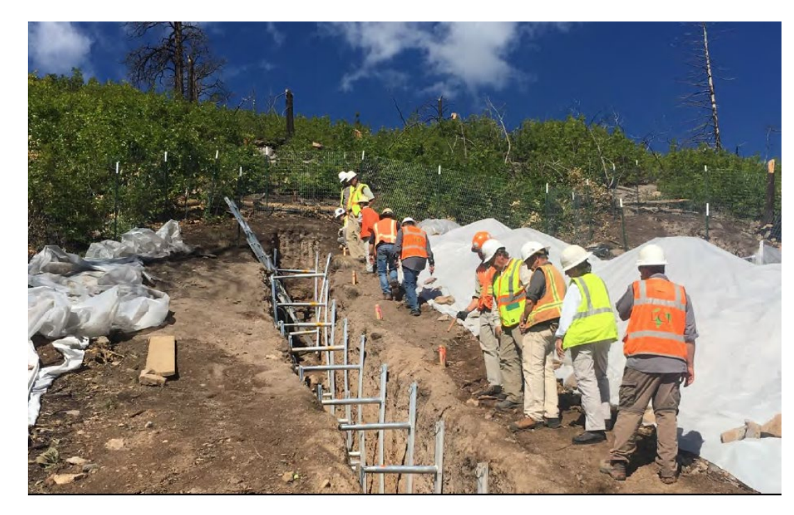
Paleoseismic Trenching Near LANL