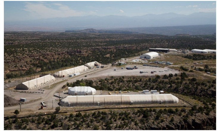
Aerial view of Area G