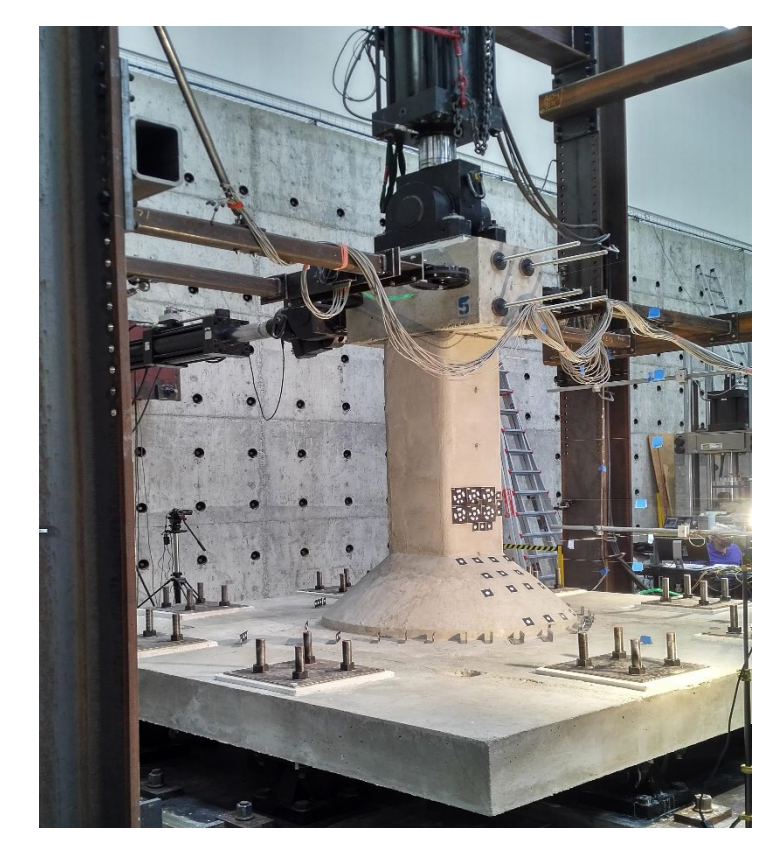
Column Capital Testing for LANL Plutonium Facility

The Board is currently awaiting DOE's response.