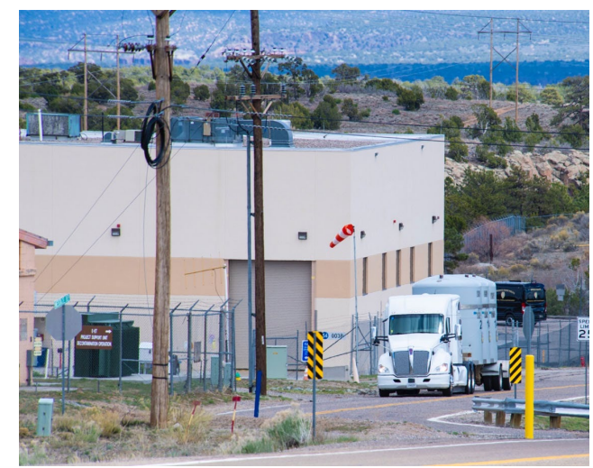
Transuranic waste shipment departing RANT