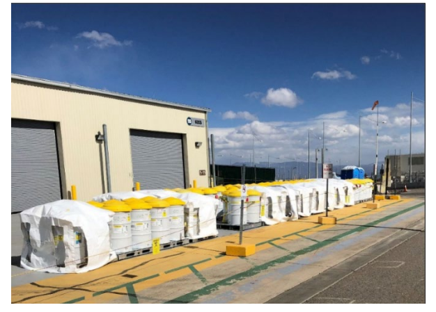
Outdoor transuranic waste storage near the LANL Plutonium Facility

The Board is evaluating DOE's response to Technical Report 46 and corrective actions that resulted from the sparking event.