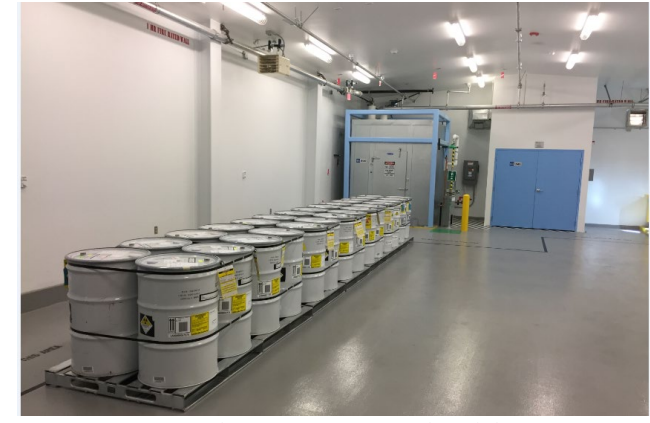
Waste drums in TWF building