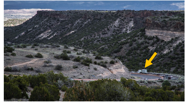
Transuranic waste shipment leaving Los Alamos