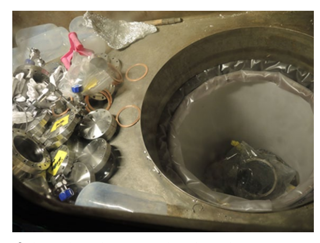
Inside of the Glovebox Involved in the Titanium Metal Fines Sparking Event at the LANL Plutonium Facility