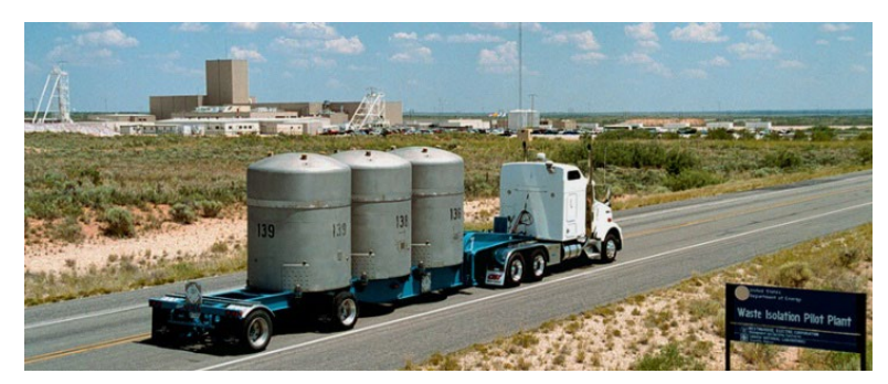
TRU waste shipment approaching the WIPP site

DOE is required by law to grant the Board "prompt and unfettered access to such facilities, personnel, and information as the Board considers necessary to carry out its responsibilities."