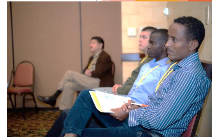
New Mexico First's 2016 Statewide Town Hall on Economic Vitality