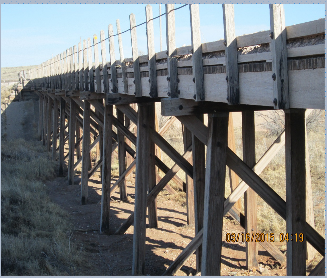
2 one lane bridges on Historic Route 66 are on County School Bus Routes