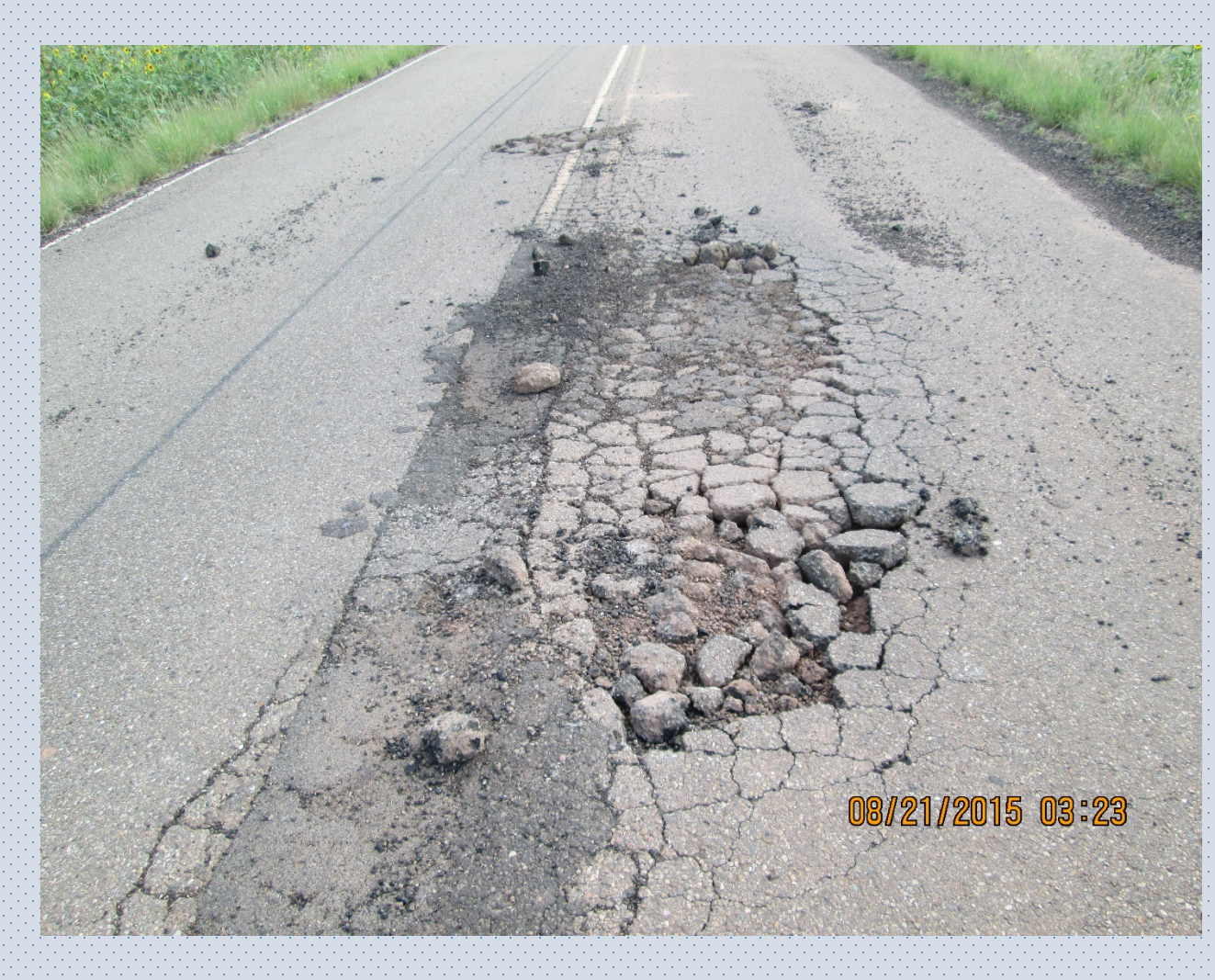
Traveled by commercial trucks because of GPS directional guides