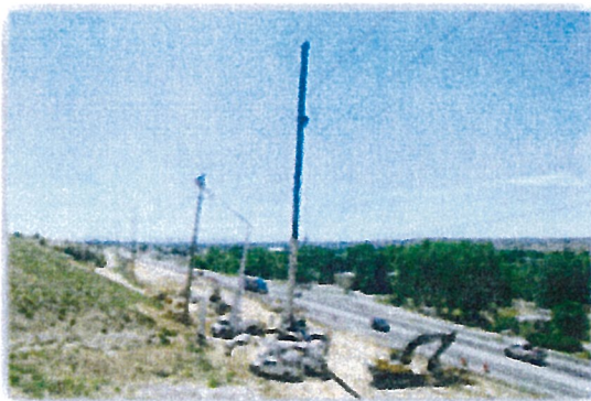
U.S. 64 Roadway Recon. Farmington to Bloomfield