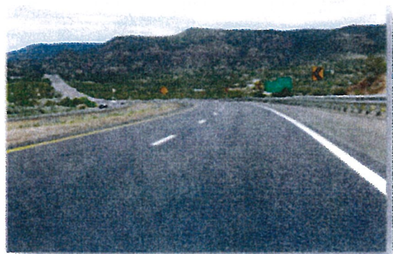
I 25 Pavement Pres. Eldorado to Canoncito