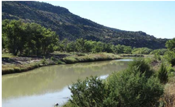
Middle Section Mills Canyon – After treatment in 2014

CRRRP also receives Water Trust Board Funding which has been used to leverage 2.5 million Pitman Roberson Funding from NM Game & Fish Dept.