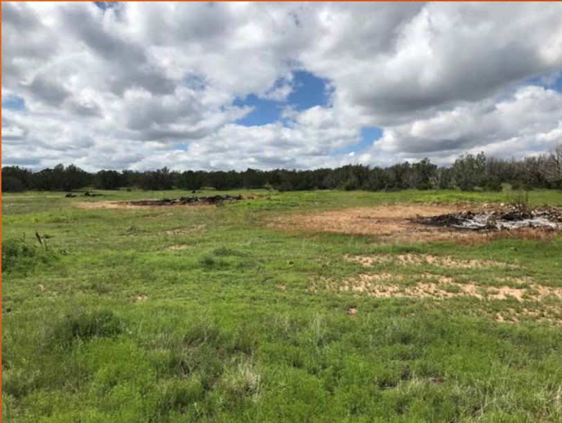
Sites after piles are burned