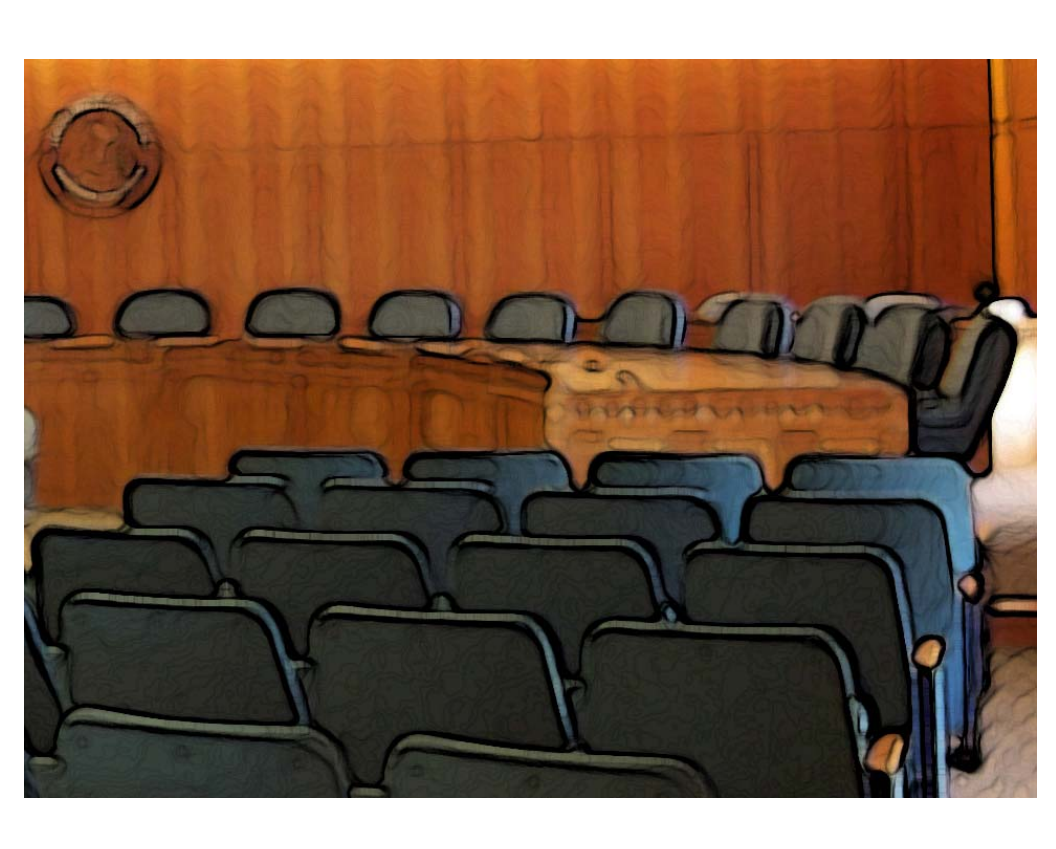
FOR THE NEW MEXICO LEGISLATURE